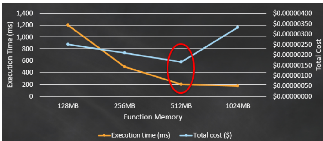
Figure 4: Choosing the optimal Lambda function memory size

particular function's logic, so the additional cost per 100 ms now drives the total cost higher. This leaves 512 MB as the optimal choice for minimizing total cost.