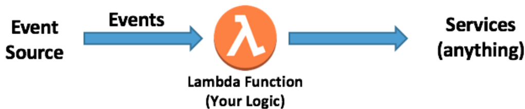
Figure 2: Simplified architecture of a running Lambda function

Your Lambda function runs within a (simplified) architecture that looks like the one shown in Figure 2.