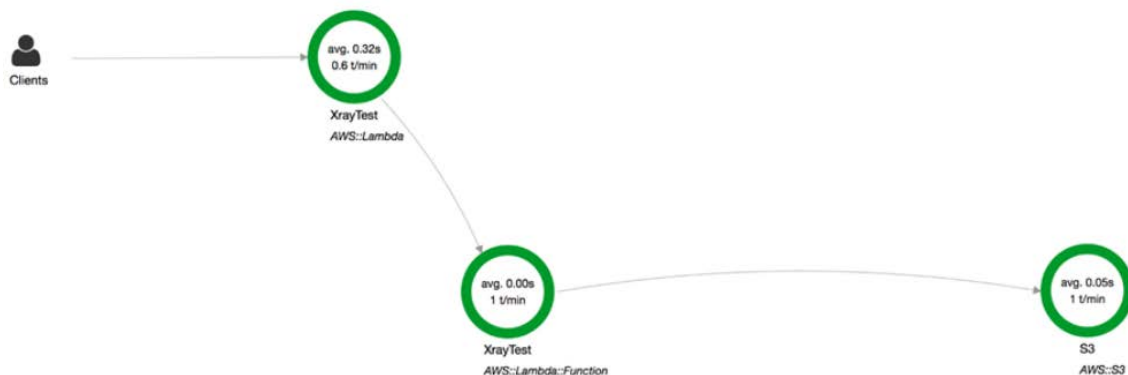
Figure 5: A service map visualized by AWS X-Ray

To get visibility into the various components of your application architecture, which could include one or more Lambda functions, we recommend that you use AWS X-Ray . 54 X-Ray lets you trace the full lifecycle of an application request through each of its component parts, showing the latency and other metrics of each component separately, as shown in the following figure.